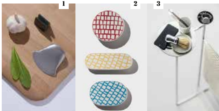
1. HERBCHOPPER, A LIMITED EDITION OF CHOPPERS IN BRONZE OR FORGED ALUMINIUM, 2018 2. BOLD MOSAIC CENTERPIECE, LIMITED EDITION OF DECORATIVE PLATES DESIGNED IN COLLABORATION WITH THE MOSAIC ARTISTS LAURA CARRARO AND MOHAMED CHABARIK, 2018. 3. LOOM FAMILY OF BATH ACCESSORIES, IB RUBINETTI , 2018.