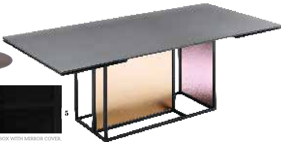
4. DAMA JEWELRY BOX WITH MIRROR COVER, DESIGNED WITH FEDERICA BIASI, INCIPIT , 2017. 5. THEO GLASS TABLE WITH BASE IN CAST GLASS AND METAL, FIAM ITALIA , 2019. 6. HOMEY COLLECTION OF WASHSTANDS AND BATHTUBS IN CRISTALPLANT AND METAL, DESIGNED WITH ATTILA VERESS, FALPER , 2018.